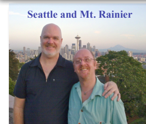
Seattle and Mt. Rainier