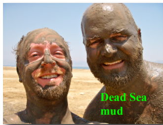
Dead Sea mud