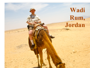
Wadi Rum, Jordan