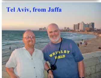
Tel Aviv, from Jaffa