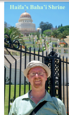
Haifa's Baha'i Shrine